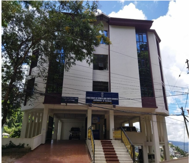
Photo of Directorate of Sports & Youth Services Building, MINECO, Khatla